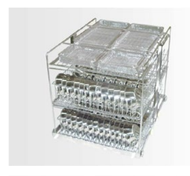
Racks for bowls and kidney trays

It is used to clean glasswares. Notice: Due to a wide range of glasswares, we need users offer the size.